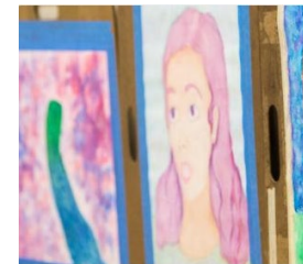
Family Life Education (FLE)

Click on Family Life Education (FLE) icon