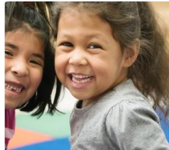
Elementary School Academics (K-6)

Scroll down and click on Elementary School Academics (K-6) icon